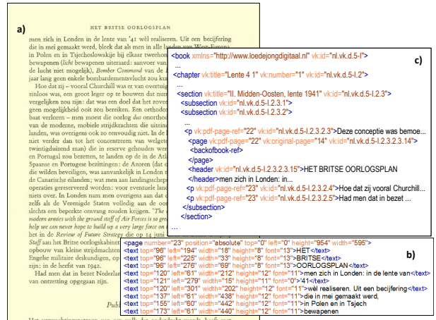
Figure 2: Results of the postprocessing steps for one page of the "Koninkrijk". The figure shows a) the original page in the OCR'ed PDF document, b) the result of the OCR in XML and c) the resulting structured XML (ellipses used for brevity).